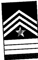
CADET SERGEANT MAJOR