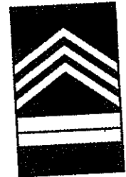
CADET SERGEANT FIRST CLASS