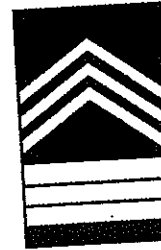
CADET MASTER SERGEANT