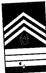
CADET COMMAND SERGEANT MAJOR