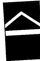
CADET PRIVATE FIRST CLASS