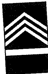
CADET STAFF SERGEANT