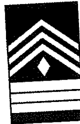
CADET FIRST SERGEANT