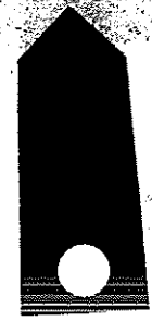
CADET SECOND LIEUTENANT